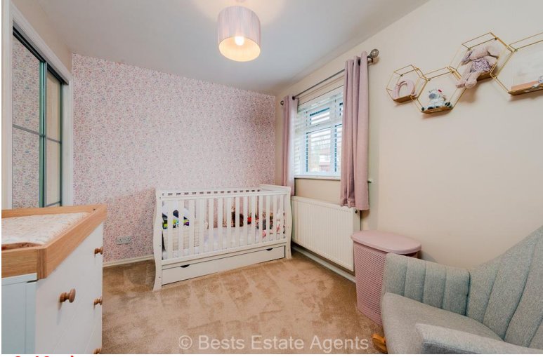
Bedroom Three Rear 8' 6" x 8' 1" (2.59m x 2.46m)

PVC double glazed window to rear elevation, double panel radiator, one triple and one single power point.